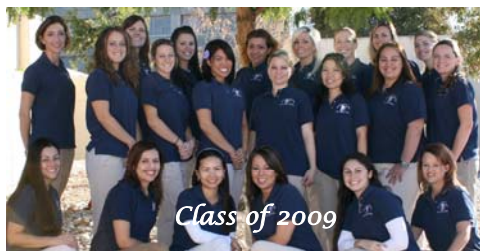
Class of 2009

to be given on-line. The outcome of this was that the graduates were not able to schedule this portion of the exam until after August 8, 2009. The clinical portion of the exam was taken at the University of Southern California, School of Dentistry, on July 10 and 11.