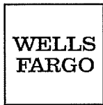
(White box with black letters)