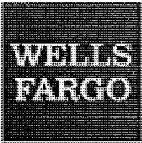
(Red box with shading)