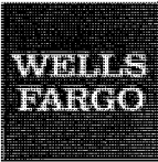
(Red box with gold letters)